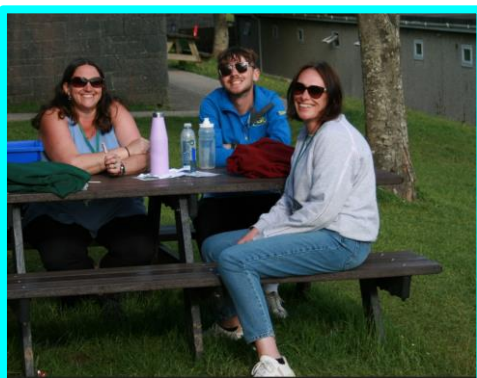
A brief moment of relaxation in Osmington Bay!